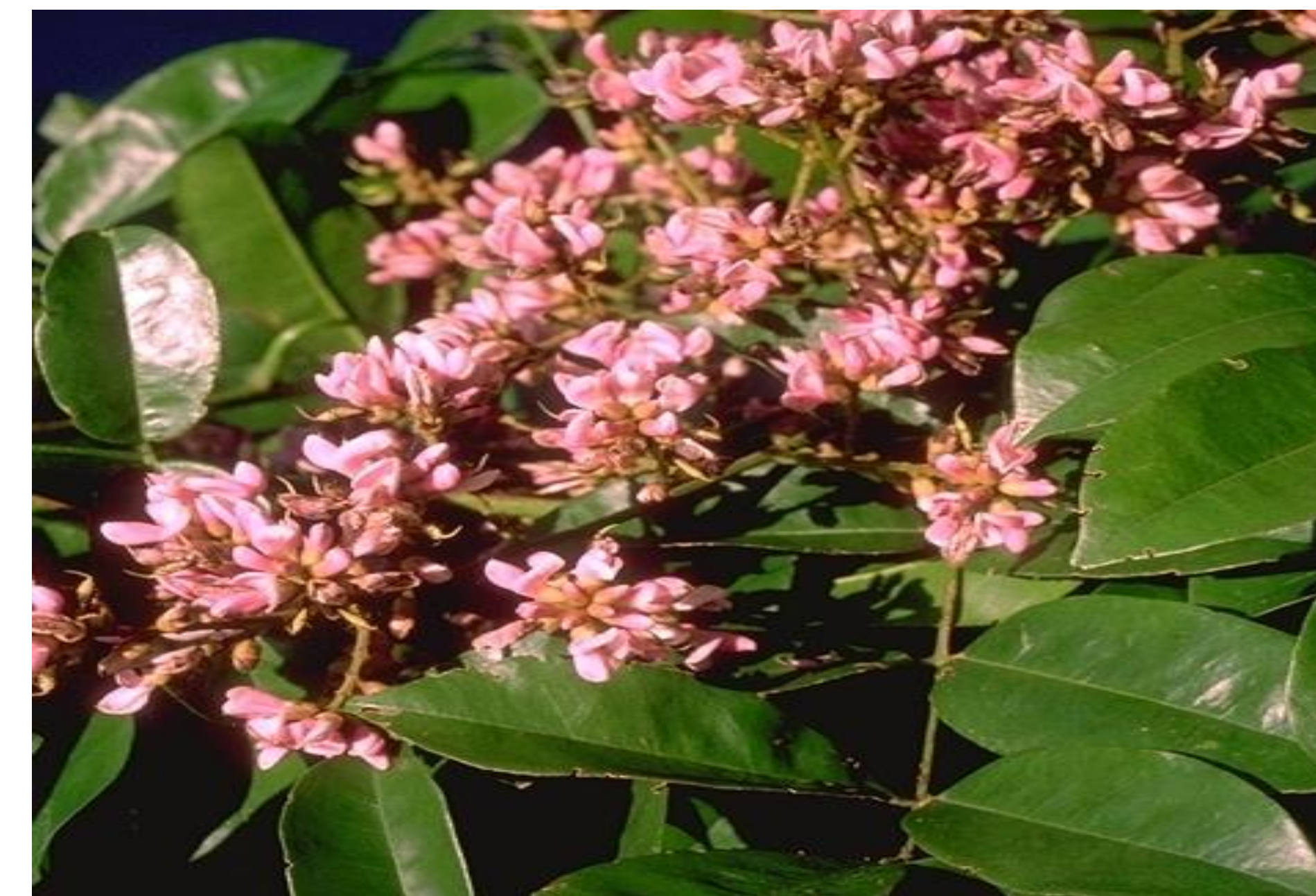
Figure 3. Biomass allocation for all species, 2L/wk.