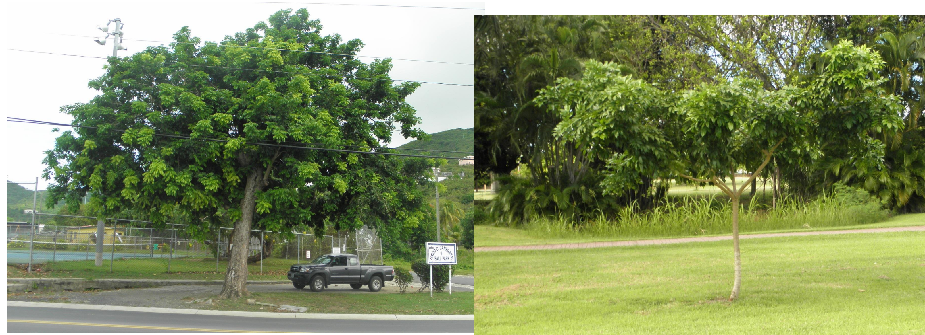
Figure 1: Mature A. inermis tree in Christiansted, notice the spreading crown. To right, 3 yr old tree

New buildings and homes require landscape plantings. The demand for ornamental plants is rising as the Virgin Islands become urbanized. The planting of native species instead of imported exotic plants around buildings and public spaces conserves water and preserves local plant biodiversity. Dog Almond is an example of a native plant that is both attractive and drought resistant. Other common names for the species are Angelin, Bastard Mahogany, Pig Turd, and Moca.