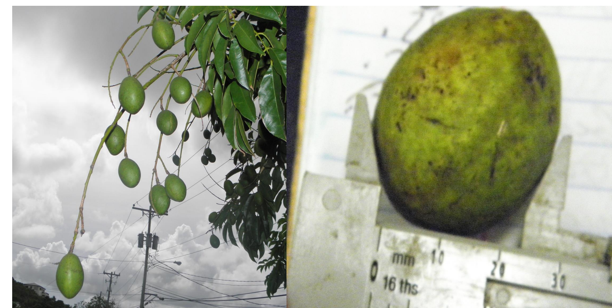
Figure 4. Fruit of A. inermis hanging from stalks, in lab. Note seed has diameter of 2 cm..