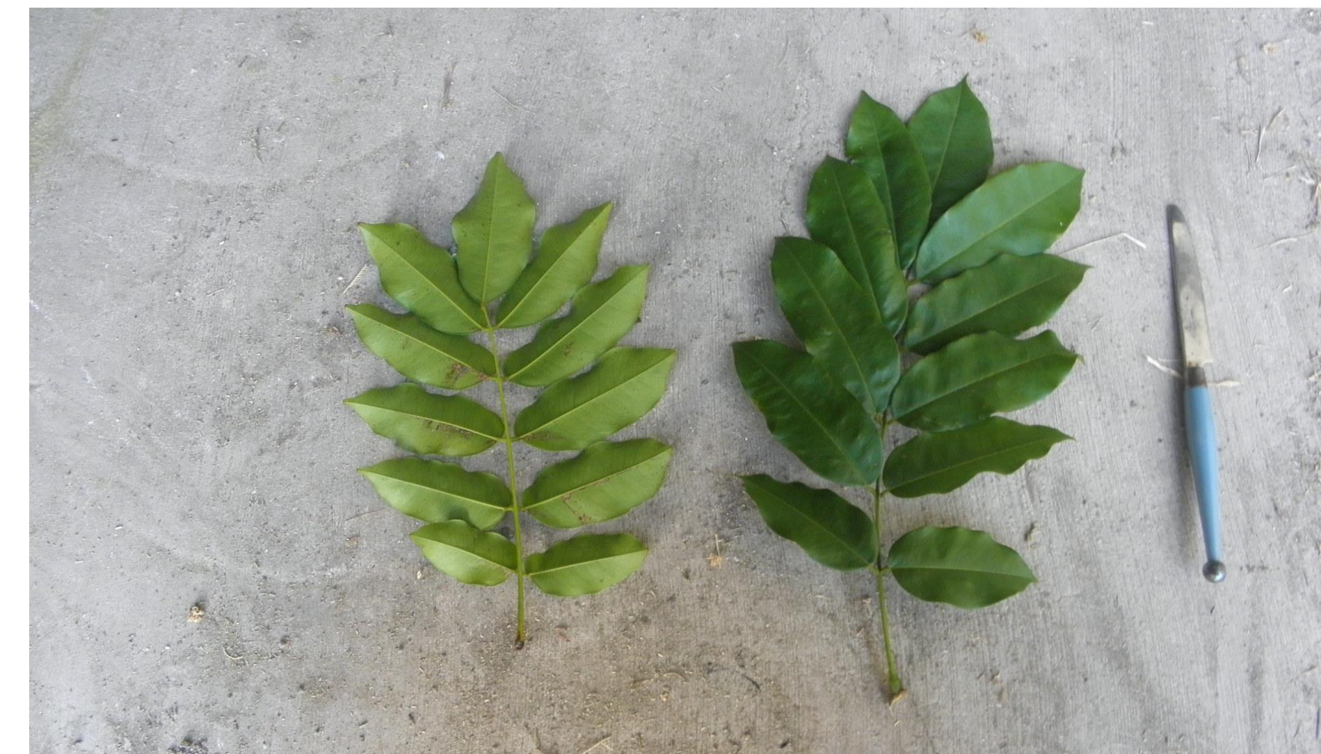
Figure 2. Leaves, back and front with pen for scale.

DISTRIBUTION: Wide spread in central and western St Croix. Throughout the Caribbean and tropical Americas, on both Atlantic and Pacific coasts. Very adaptable species growing on large range of sites. In St Croix, grows from about sea level to the summit of Mt Eagle, (355m)