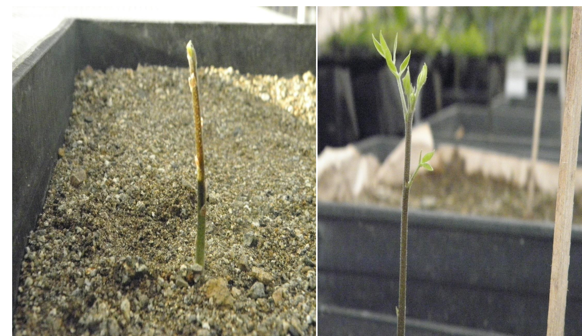
Figure 5, Up close views of germinating seeds

DISTRIBUTION ECOLOGY. Found in woodlands, along streams and roadsides. Considered a long lived pioneer and very important early colonizer of open fields and other disturbed sites. Fruit bats disperse the seeds far and wide. IN fact, the genus name Andira refers to the word for bat in some Amerindian language. Large seed allow seedlings to persist in shade of tall grass or forest understory so seedlings can get established and wait until there is a clearing in overstory. Once in the light trees grow fast, and live a long time. Trees planted at UVI average 2 m of height growth in first two years. "The adaptability of this species to a wide variety of sites, at its capacity to produce large quantities of bat dispersed seeds make it one of the most wide spread species in Puerto Rico"